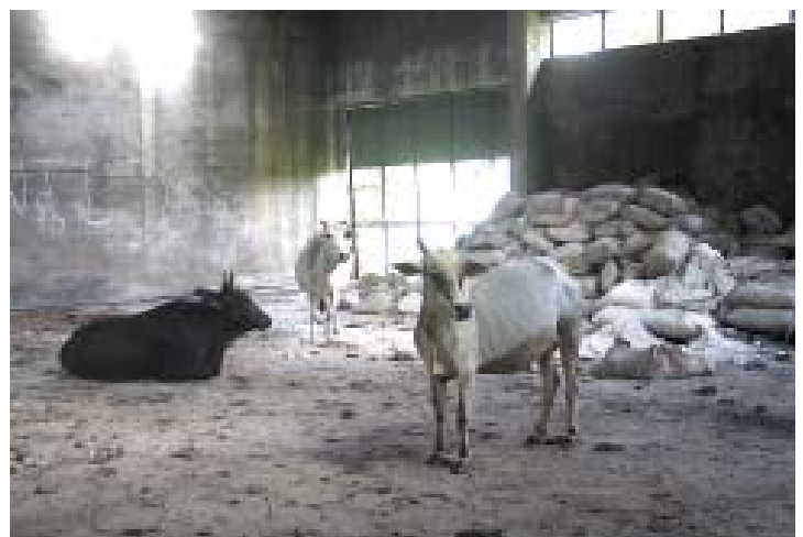
Bags of chemicals lie strewn around the UC plant