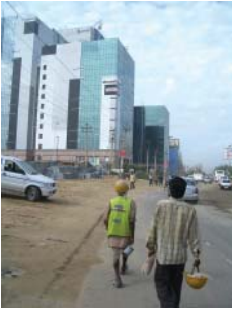
Accidents are common to construction sites. Yet, very often, safety equipment and other precautions are ignored.