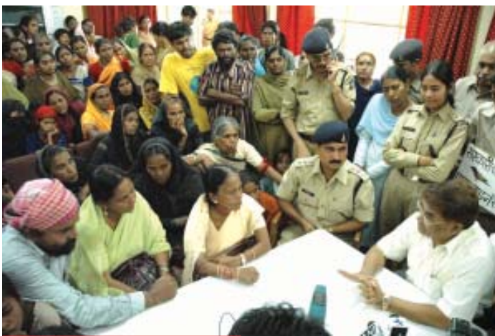
Gas victims with the Gas Relief Minister