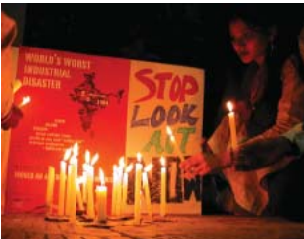
The struggle for justice goes on...