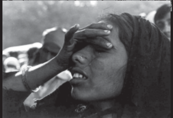
The next morning