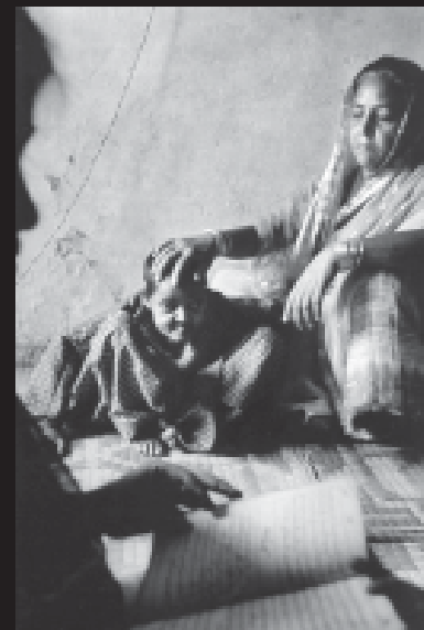
A child severely affected by the gas

Most of those exposed to the poison gas came from poor, working-class families, of which nearly 50,000 people are today too sick to work. Among those who survived, many developed severe respiratory disorders, eye problems and other disorders. Children developed peculiar abnormalities, like the girl in the photo.