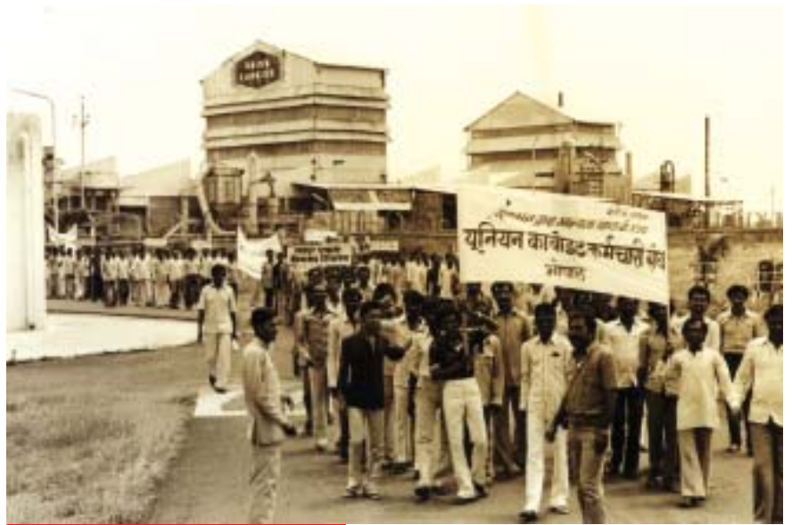
Members of UC Employees Union protesting