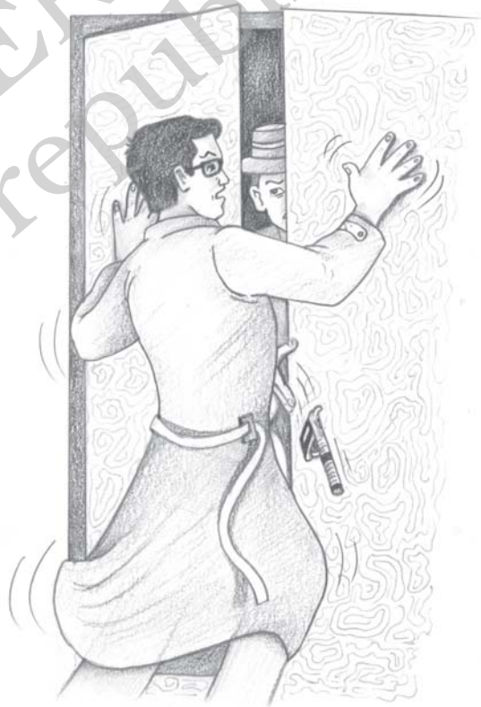
Gerrard gives him a push into the cupboard...

GERRARD : I have got a man posted on the main road. He'll ring up if he sees the