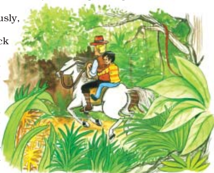
This is Jody's Fawn

sidled back: walked back quietly, trying not to be noticed